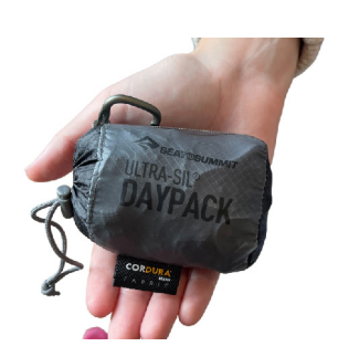
*Packs down to fit in the palm of your hand*